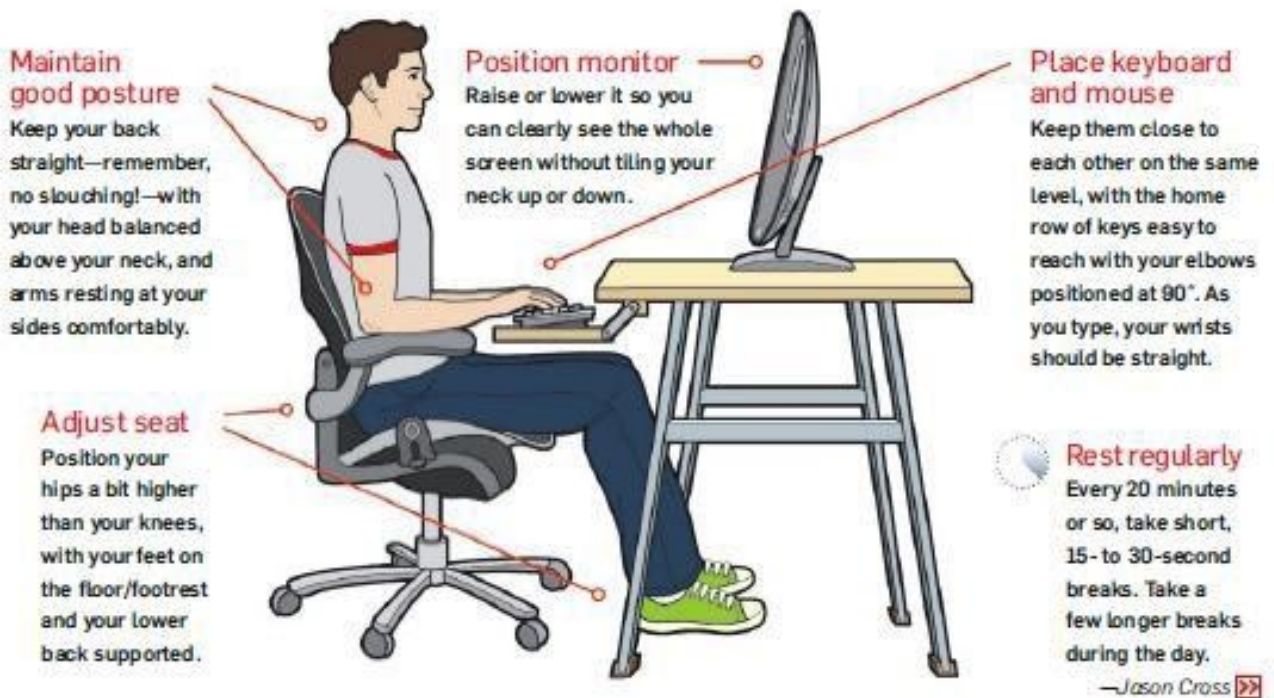
Diagram 2- Ergonomic Laptop Use

These tips come courtesy of Steve Meagher, from ergonomics consulting firm Site Solutions.